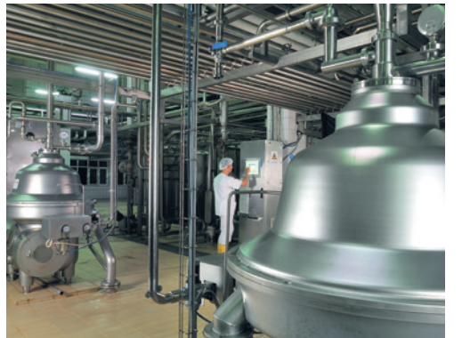
Milk and Milk Derivatives