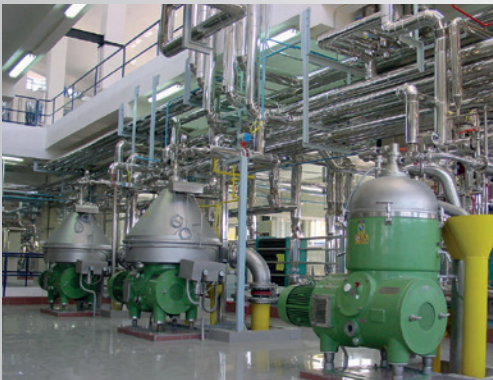
Pharmaceutical and chemical plants