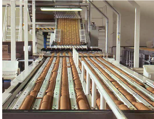
Biscuit Factory Process