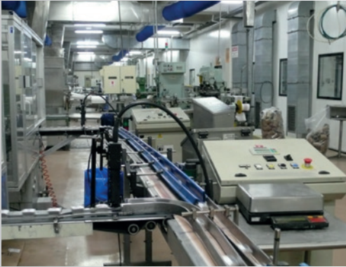
Baker's Yeast Plants