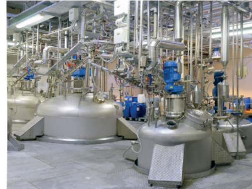
Pharmaceutical and chemical plants