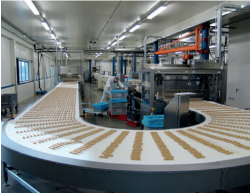
Biscuit Factory Process