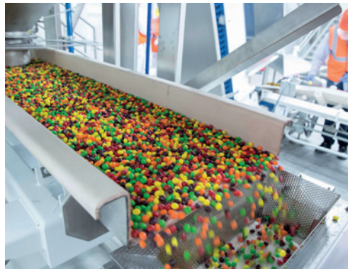
Confectionery Factory Process