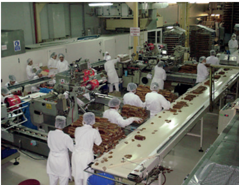
Cake Factory Process