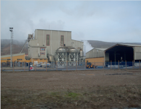
Edible Salt Plants