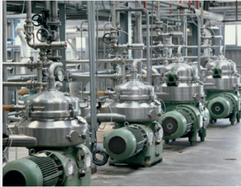
Baker's Yeast Plants