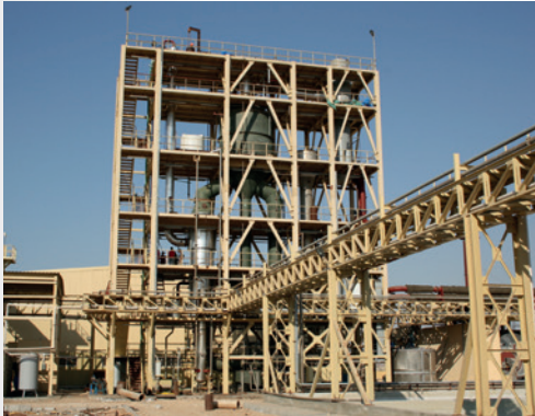
Edible Salt Plants