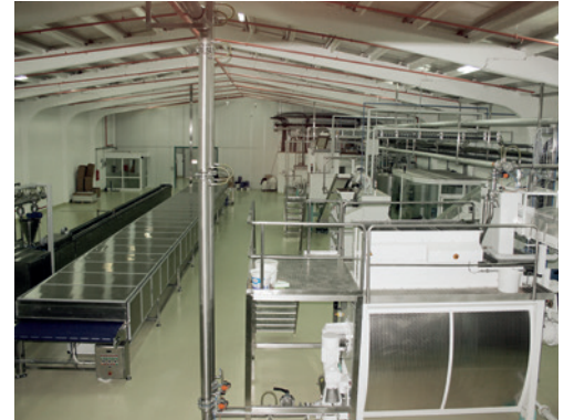
Chocolate Factory Process