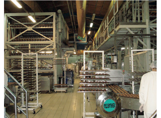
Cake Factory Process